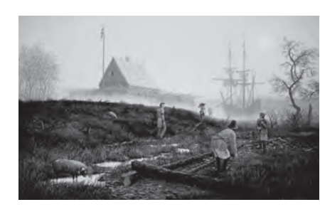
Fort Nassau, 1614

For more about the origins of the Dutch-American relationship, visit: newnetherlandbeginnings.info