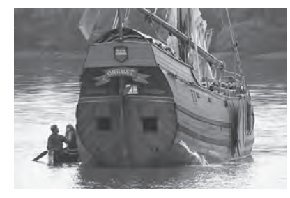
In the winter of 1613-14, Adriaen Block's Onrust became the first ship built in North America.